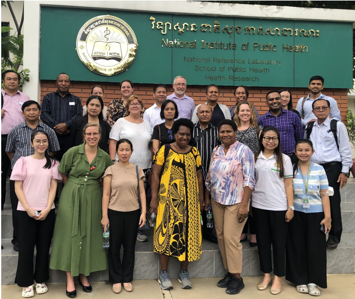
Site visit to NRL - 25 October