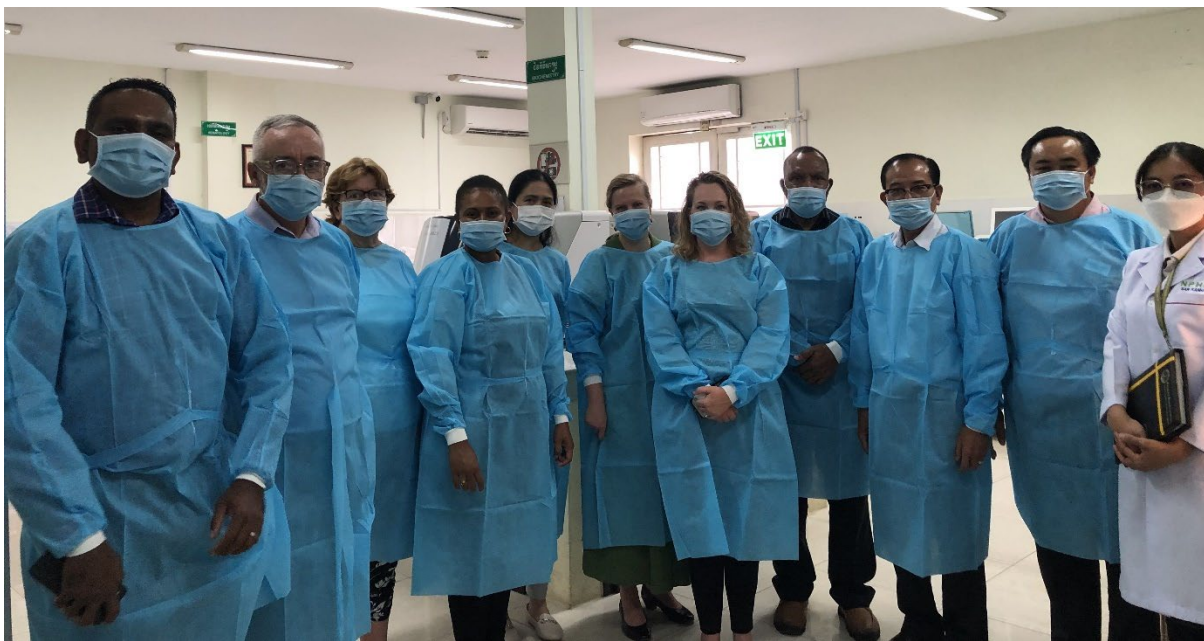
Site visit to NRL - 25 October