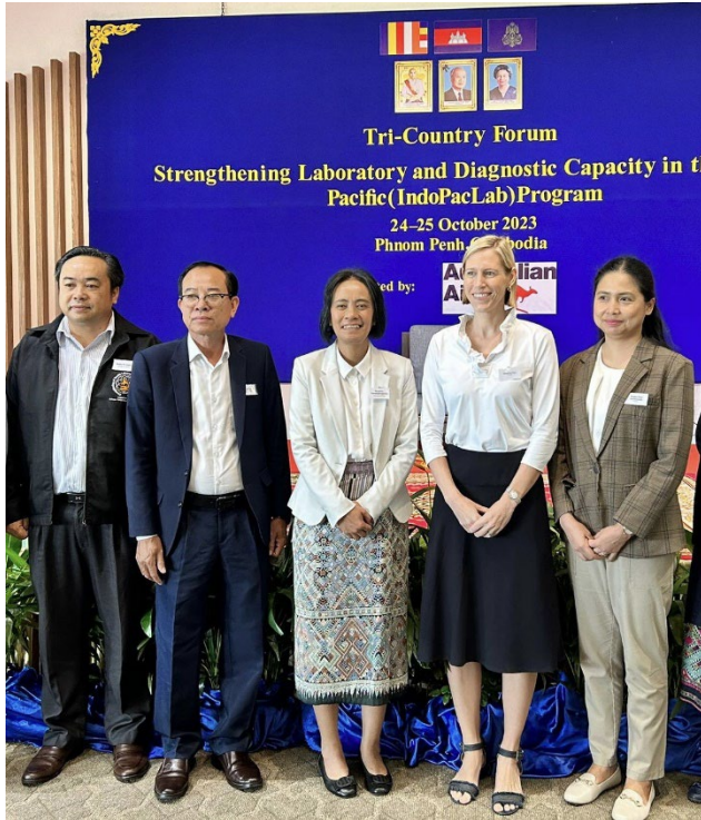
Lao PDR Program Colleagues - 24 October