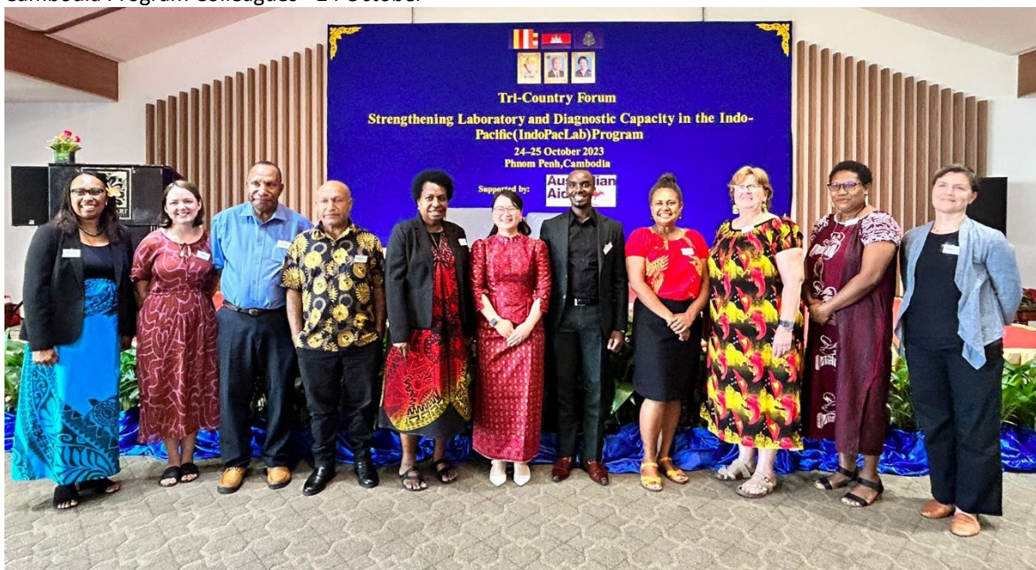
PNG Program Colleagues - 24 October

The IndoPacLab Program is supported by the Australian Department of Foreign Affairs and Trade (DFAT) and is implemented by the IndoPacLab Consortium.