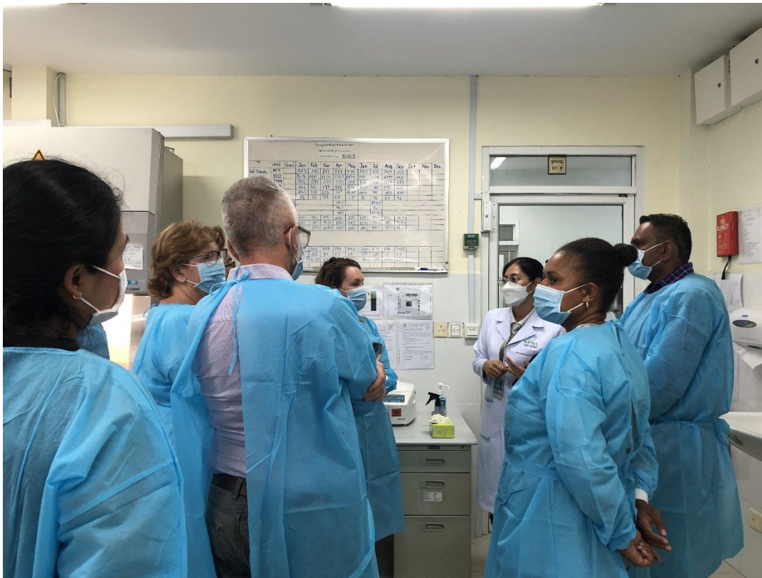
Site visit to NRL - 25 October

The IndoPacLab Program is supported by the Australian Department of Foreign Affairs and Trade (DFAT) and is implemented by the IndoPacLab Consortium.