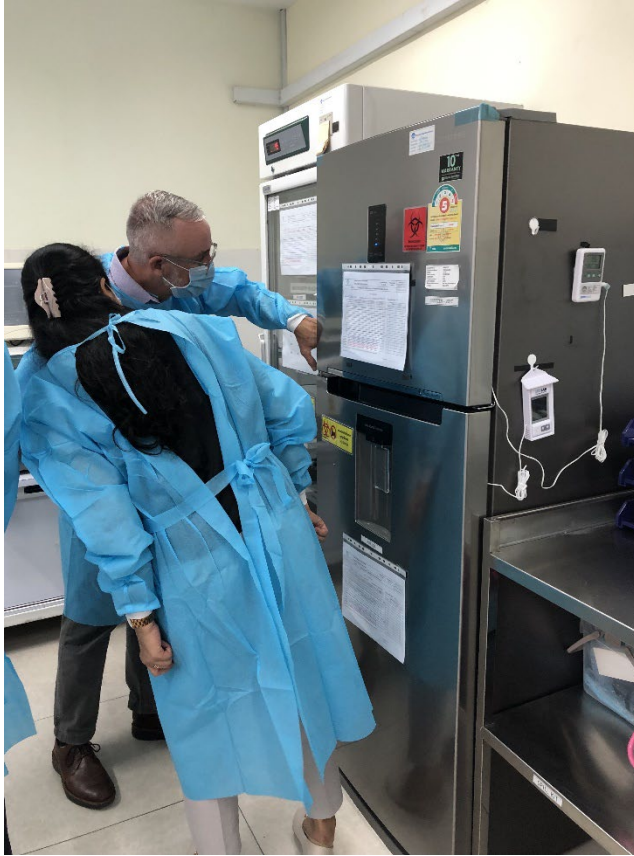
Site visit to NRL - 25 October