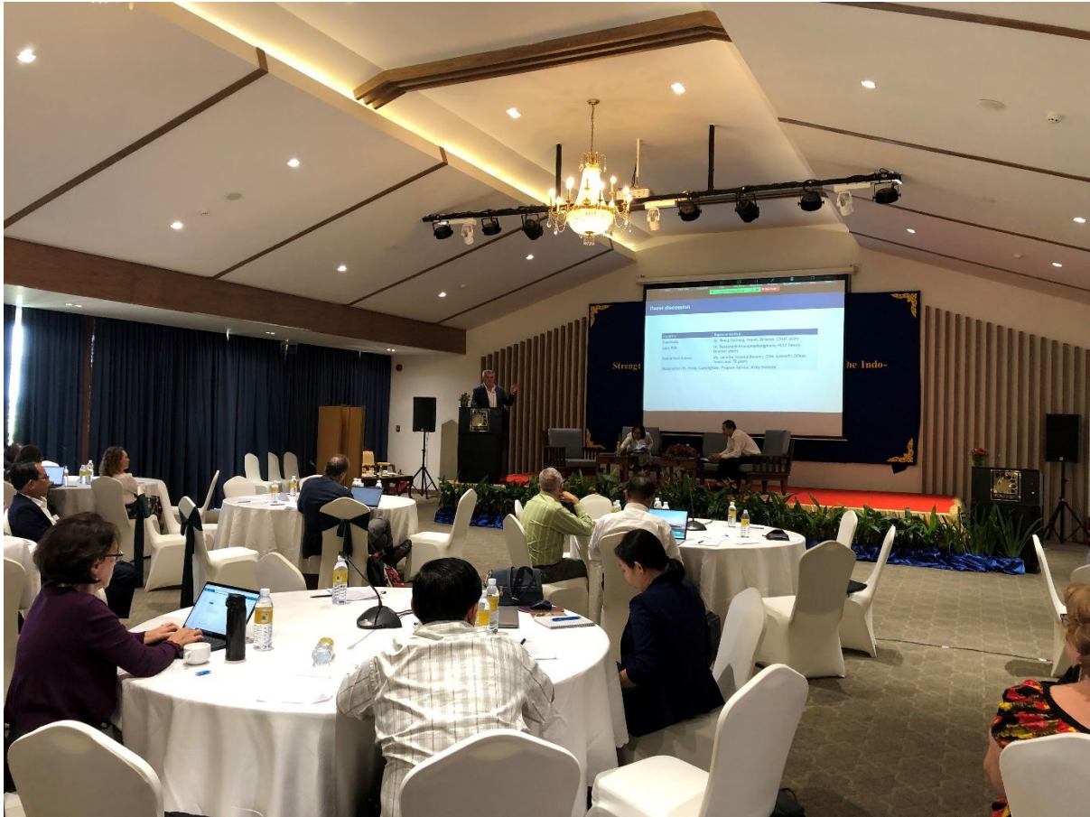
Panel Session, DNO - 24 October