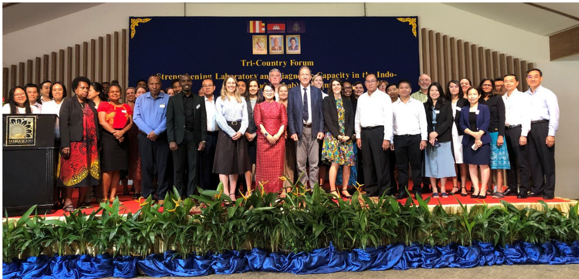
All attendees - 24 October