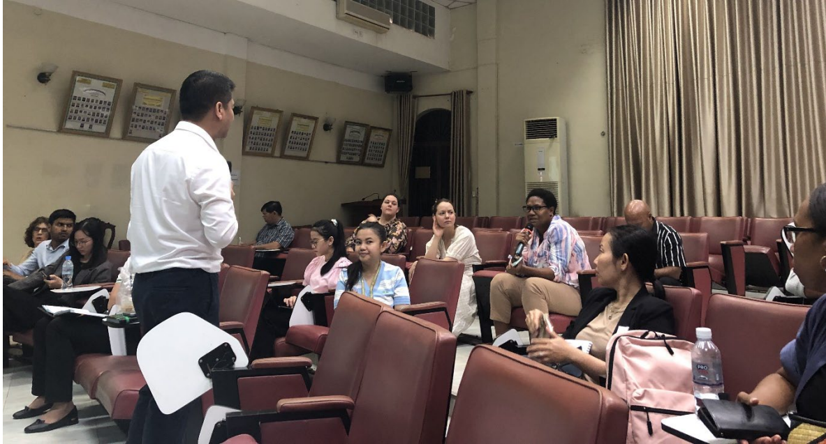
Site visit to NRL - 25 October