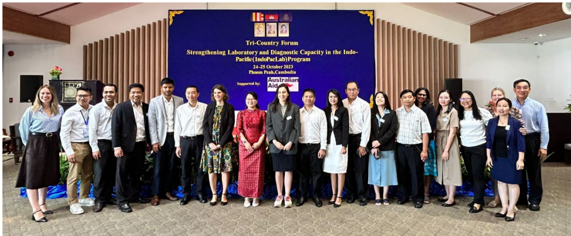
Cambodia Program Colleagues - 24 October