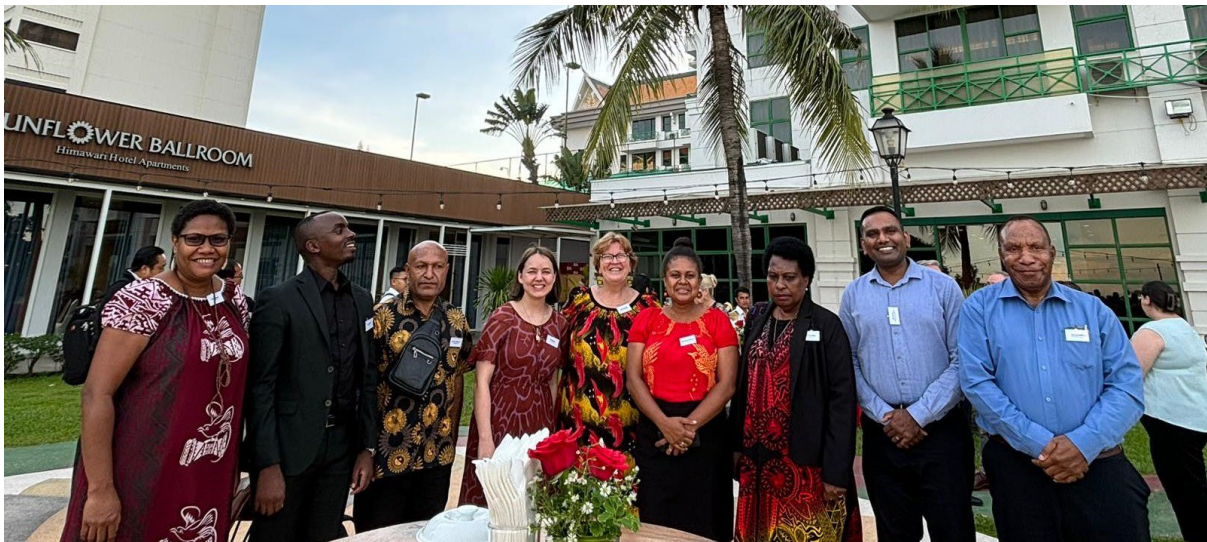
PNG program colleagues at networking event - 24 October

The IndoPacLab Program is supported by the Australian Department of Foreign Affairs and Trade (DFAT) and is implemented by the IndoPacLab Consortium.